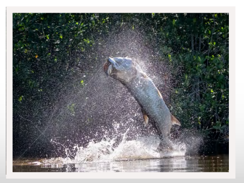
Chaos in the Mangroves