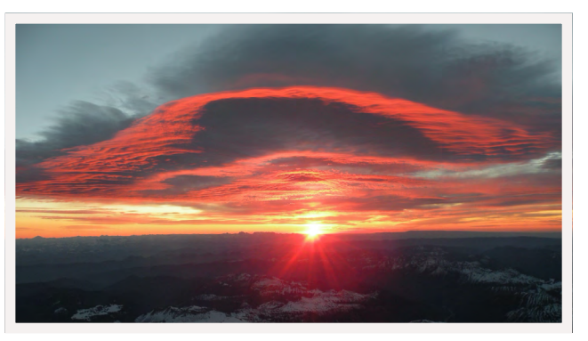
Sunrise at Mt Rainier