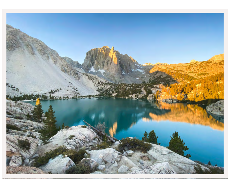
Big Pine Lake, Inyo National Forest Wilderness | Johnny Wang