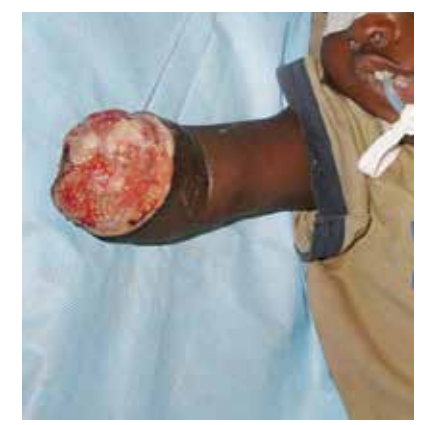
Figure 7. Upper extremity amputation in a young patient . (Bar-On)