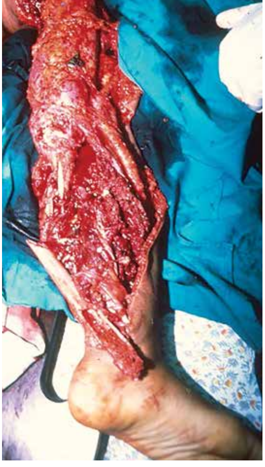
Figure 2. Severe soft tissue damage and open fracture of the lower limb that required amputation ( Bar-On )

There is disagreement among surgeons as to whether the local prosthetics and rehabilitation capacity should dictate the level and type of an amputation. Some advocate always taking these factors into account, while others feel that in conflicts and SODs it is often impossible to know what services may be present in the months and years ahead.