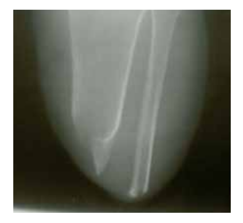
Figure 11. Osteophyte formation on the tibia, and overly long fibula causing pain and stump erosion in a BKA patient.

» All patients in disasters and conflict sustain psychological as well as physical trauma. The additional trauma of undergoing an amputation can precipitate mental health problems such as depression, aggressiveness or substance abuse. The entire treatment team should be vigialant regarding these issues.