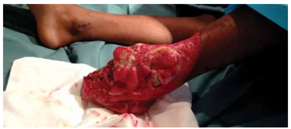
Figure 1. Traumatic Amputation of the left leg (Bar-On)