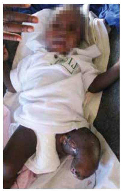
Figure 8. Amputations in children require special attention due to the fact that the bones are often still capable of growth. (Bar-On)