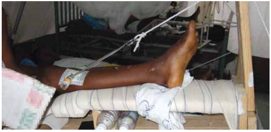
Figure 11. Construction of a traction frame in the field. (J. von Schreeb)