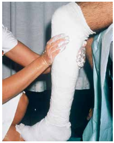
Figure 4. Molding a tibial cast by indenting thumbs into both sides of the patellar tendon.