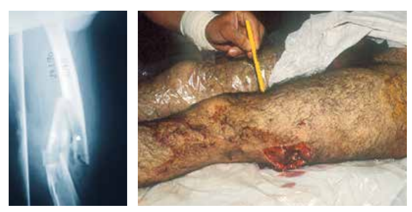
Figure 1. LEFT: Large wound resulting from GSW of the thigh

Figure 2. FAR LEFT: Displaced femur fracture following GSW to the thigh