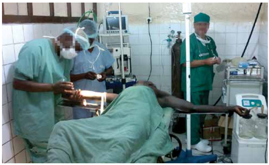
Figure 4. Health staff involved in preoperative procedures (Baumgartner-Henley)