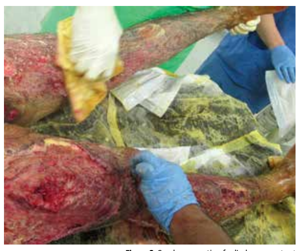
Figure 3. Scrub preparation for limb surgery (Kay)

Potable (drinkable) water is adequate for wound washouts; warm it to 38–41 degrees C. This temperature is that of a warm shower. In other words, warm to the touch but tolerable to keep ungloved hands immersed.