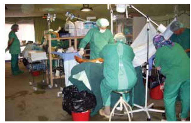
Figure 2. Operating theatre with multiple teams (Baumgartner-Henley)